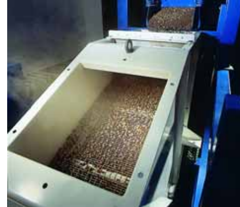
We at Mogensen can help customers verify potential screening solutions in our testcenter

In the comprehensive accessory programme, there are several systems for wear protection as well as different types of screen cloth cleaning. Electrical control and supervision systems, giving high operational reliability can also be supplied. The compact design and the excellent accessibility to the screen cloths and the vibrator contribute to short downtimes and good operational economy.